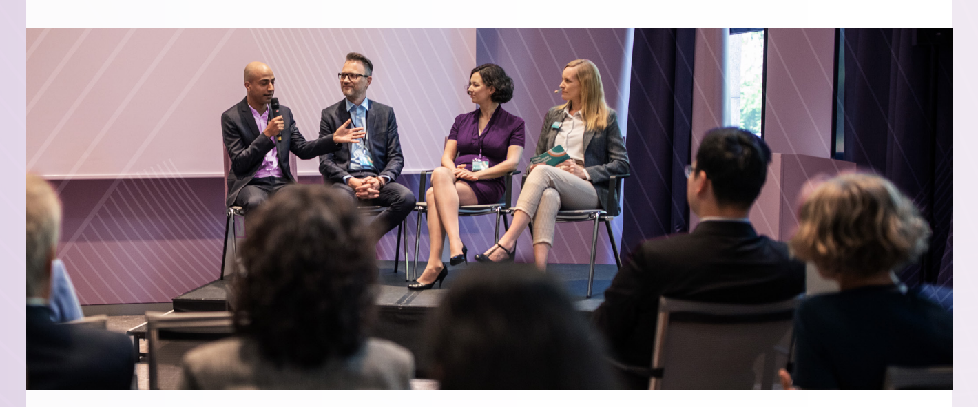
Prices and offerings may be subject to change.